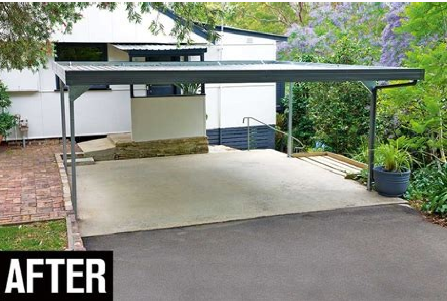
Metal carport plans free download.