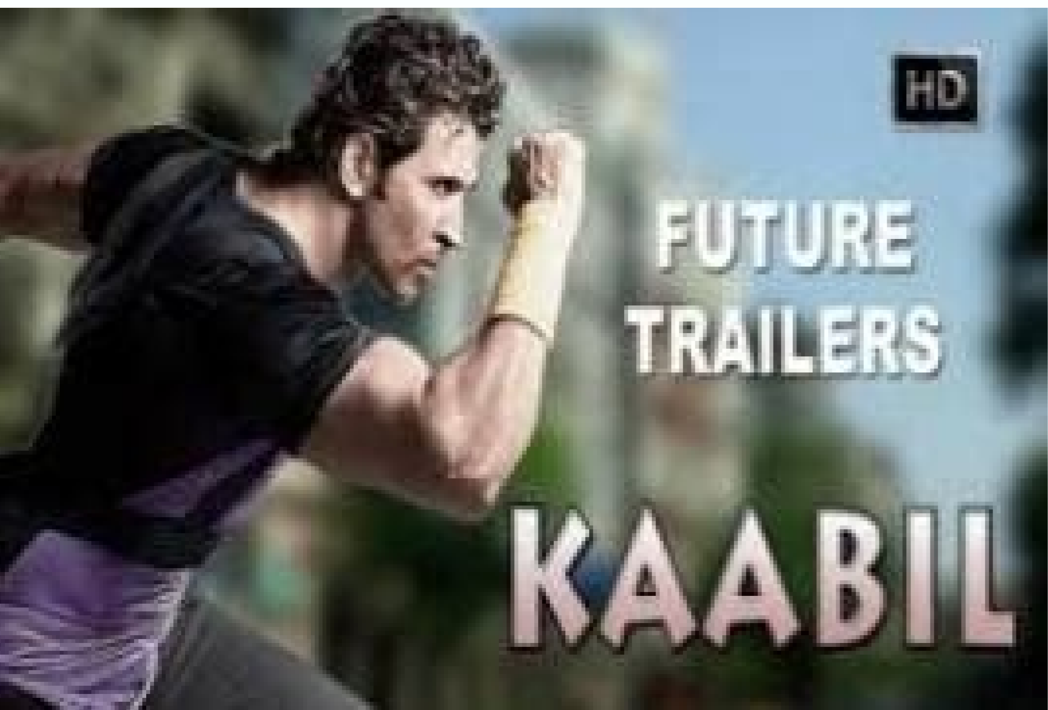
Kaabil full movie download hd 1080p free download. Balam (kaabil) (2017) hd telugu full movie watch online free. Kaabil full movie hd 720p free download. Kaabil full movie watch online free hd download. Kaabil full movie watch online free hd. Kaabil full movie hd free download.